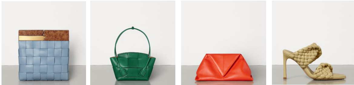
The Shopping Concierge lists a selection of 80 products from Bottega Veneta's Spring/Summer 2020 collection. (From L-R): BV Snap in Ice, Mini Arco in Racing Green, Envelop Clutch in Orange, and BV Curve in Tapioca.

Fans of Bottega Veneta would be thrilled to learn that top hits from the Italian luxury brand's Spring/Summer 2020 ready-to-wear runway show are now within reach at the click of a button. Led by the ingenious Daniel Lee, creative director of the Italian fashion house, this collection includes as many as 80 'IT' bags and shoes of the season – including the Arco, BV Snap, and Envelop Clutch – and cult-classics like the BV Curve sandals featuring the brand's iconic intrecciato weaving technique.