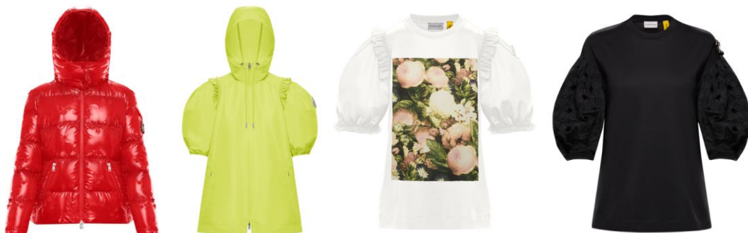
The ‘4 Moncler Simone Rocha’ collection is exclusive to The Shoppes. (From L-R): 4 Moncler Simone Rocha Callitris in Red, 4 Moncler Simone Rocha Pansy in Lime, 4 Moncler Simone Rocha T-Shirts in white and black.

Fashion purveyors can now shop a curated collection of coats and t-shirts from 4 Moncler Simone Rocha, a collaboration between Moncler Genius and the award-winning designer. Exclusive to its existing flagship duplex store located at The Shoppes, these apparel are just some of the many items available for delivery, along with the French-Italian brand’s signature parkas, nylon technique jackets and sneakers.